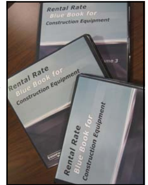
All three Blue Books available at the UCA offices! Call today to set up an appointment to use the books!

Don't forget to call UCA staff and schedule to visit our offices to review the 3-volume set any day of the week. UCA's normal business hours are Monday through Friday, 8:00 a.m. until 5:00 p.m.