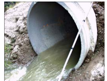
Storm water outlet releasing sewage.