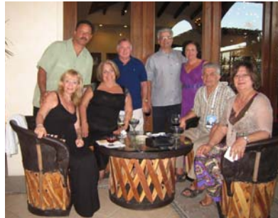
Guests from MQ Sewer & Water Contractors, Inc. and Holiday Sewer and Water Construction Company, Inc. catch up at the President's Dinner.

Tuesday evening was the Associates' Fiesta Party, where staff and members donned traditional Mexican garb. The Whales Terrace by the beach was set with beautiful sarapes and a rainbow of napkins adorning the tables, colorful scarfs around the chairs, and live music to dance to performed by a local band. The meal had an additional last minute treat: freshly caught