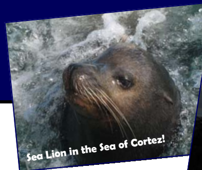
Sea Lion in the Sea of Cortez!

The companies listed in UCA's Directory are all UCA members and deserve your preference when looking for products and services.