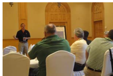
UCA's Legislative Affairs Director updates the attendees on the current happenings of the state and federal government.