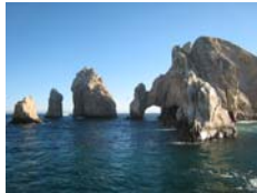
Los Cabos' Famous Arch!

UCA members had a lovely 39th Annual Convention on a return visit to the Fiesta Americana Grand Resort in charming Cabo San Lucas, Mexico over the dates of January 24-29, 2010.