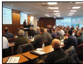
Sewer Rehab Seminar held in the Laborers' Chicago Training Center.