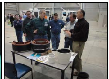
Attendees viewing sewer gasket seals.