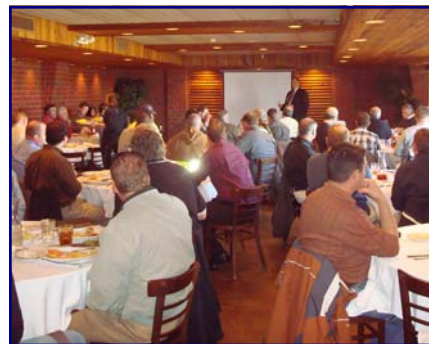
Statewide contractor members listen to IEPA Associate Director on April 7th in East Peoria, IL.