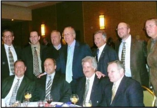
UCA members attend a dinner honoring former Deputy Chief of Staff Karl Rove.

"Money is the mother's milk of politics."