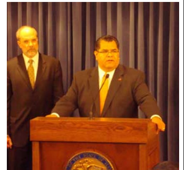
Senator Sandoval speaks at a press conference announcing his support for the TFIC plan.

TFIC has recommended that the required program increase be funded by a combination of sources and reduce road fund diversions. Revenue includes the use of state and/or local bonds, and an increase in state and/or local revenues, such as increased driver's license and plate fees, and a modest expansion of existing gaming facilities. The Illinois General Assembly is also considering an increase in the motor fuel tax of at least 8 cents per gallon.